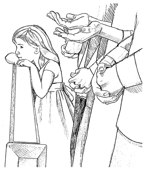
"For where two or three come together in my name, there am I with them." Matthew 18:20. NIV

"...an house of prayer for all people." Isaiah 56:7